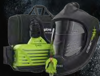
Art.-Nr. 4900.250 optrel Ready-to-Grind Package, consisting of clearmaxx, e3000X, parking buddy and bag