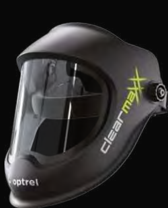
Art.-Nr. 1100.000 optrel clearmaxx standard version