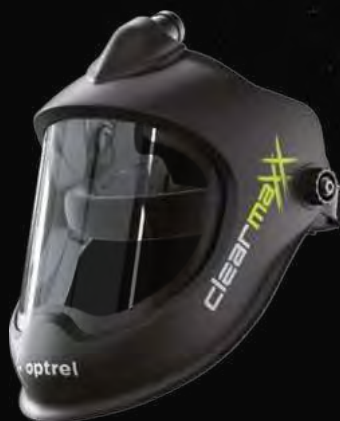
Art.-Nr. 4900.020 optrel clearmaxx PAPR version